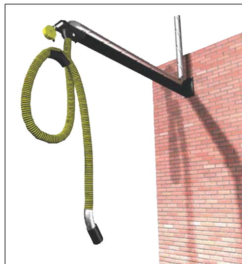
FE with PA-220 extension mount.

PlymoVent reserves the right to make design and technical changes.