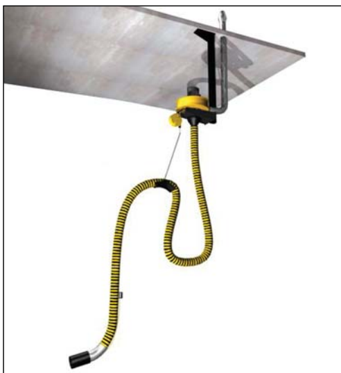
FEF with PA-110 extension mount.

There are many advantages to the retractable hose dropper over what you may have today. Here are just a few: